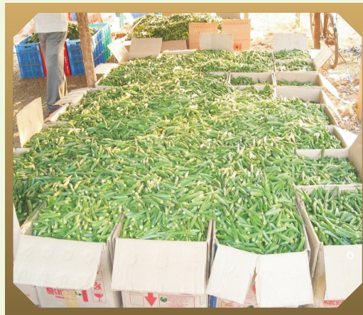
Graded okra is ready to export