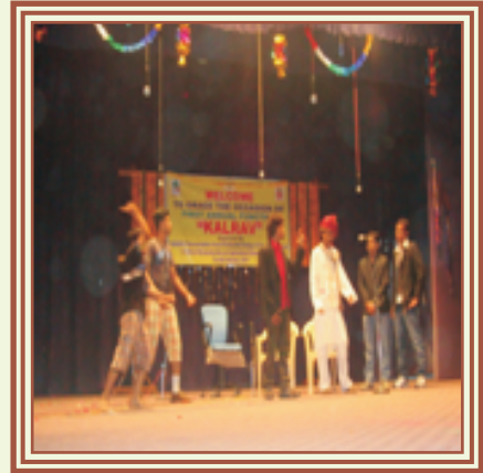
Annual Day Celebration