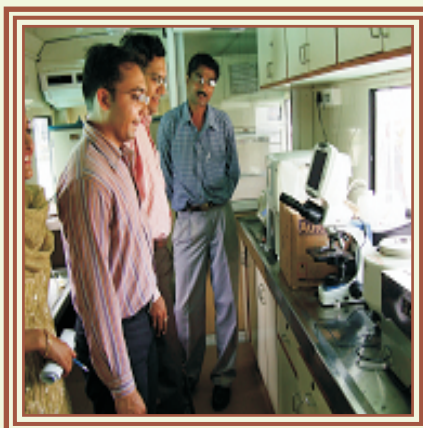
Inside Mobile Veterinary Clinic