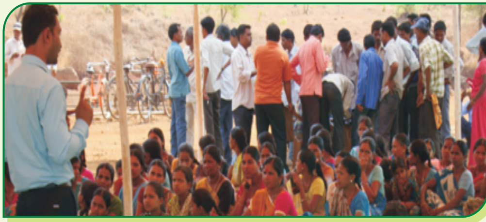
Expert delivering lecture during Krishimahotsav 2011