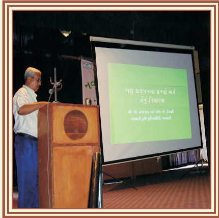
Reproductive Problems and their control