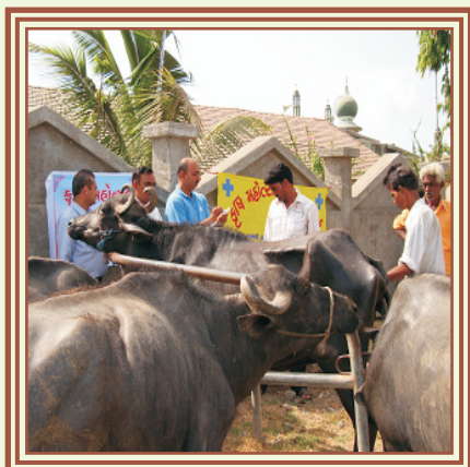
Clinical camp at Village