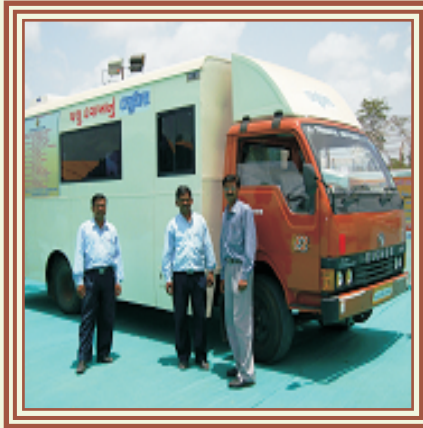
Mobile Veterinary Clinic