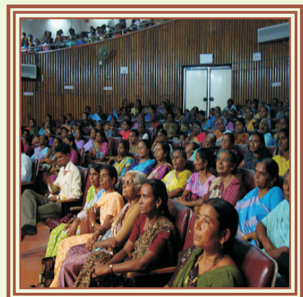
Mahila Pashupalan Parisamvad