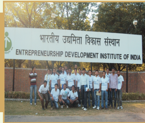
Students visiting EDI at Gandhinagar