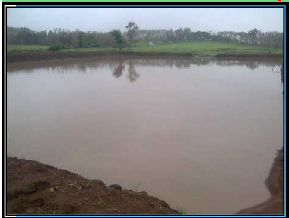
Kvk Farm Pond