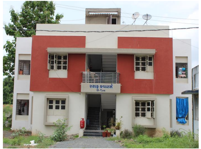
Newly constructed Staff Quarters